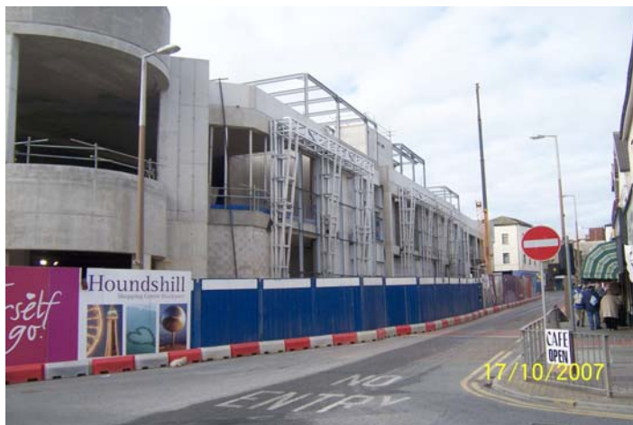
Coronation Street Elevation

If you have any queries in the meantime, please contact either Gaynor Holland on 01253 624722 (centre related queries) or Josie Neil on 01253 627283 (construction related queries).